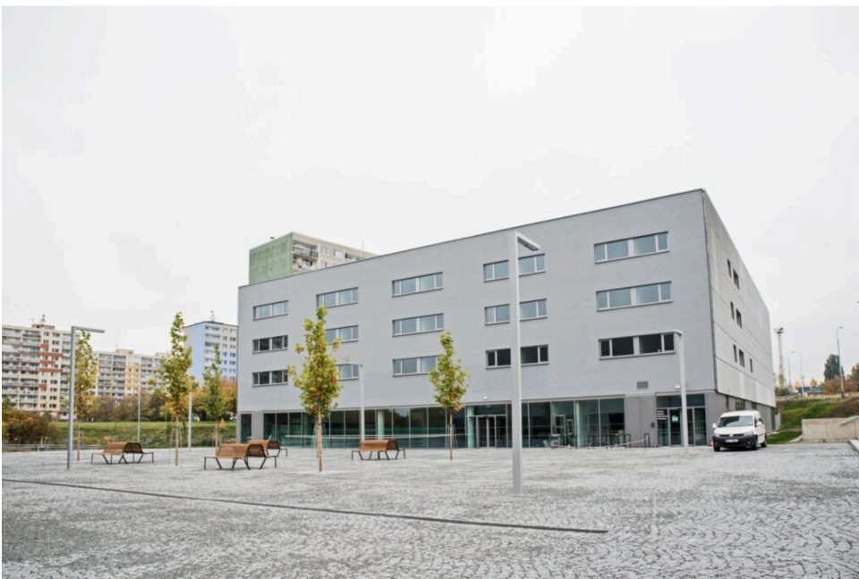
Building of the restaurant and the hotel across the sports venue